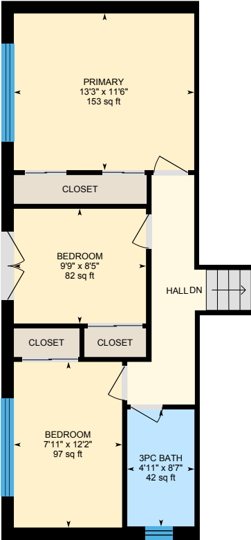
1st Floor Exterior Area 613.73 sq ft