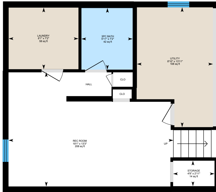
Basement (Below Grade) Exterior Area 284.08 sq ft